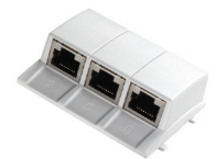
ETHERNET MODULE KT-6511-0000D-WR

For more information on how the AP 6511 can benefit your business, please visit us on the web at www.motorola.com/ap6511 or access our global contact directory at www.motorola.com/enterprisemobility/contactus